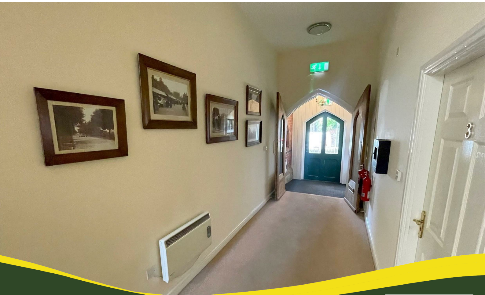
Apartment 5 Sugden House, Stockwell Street